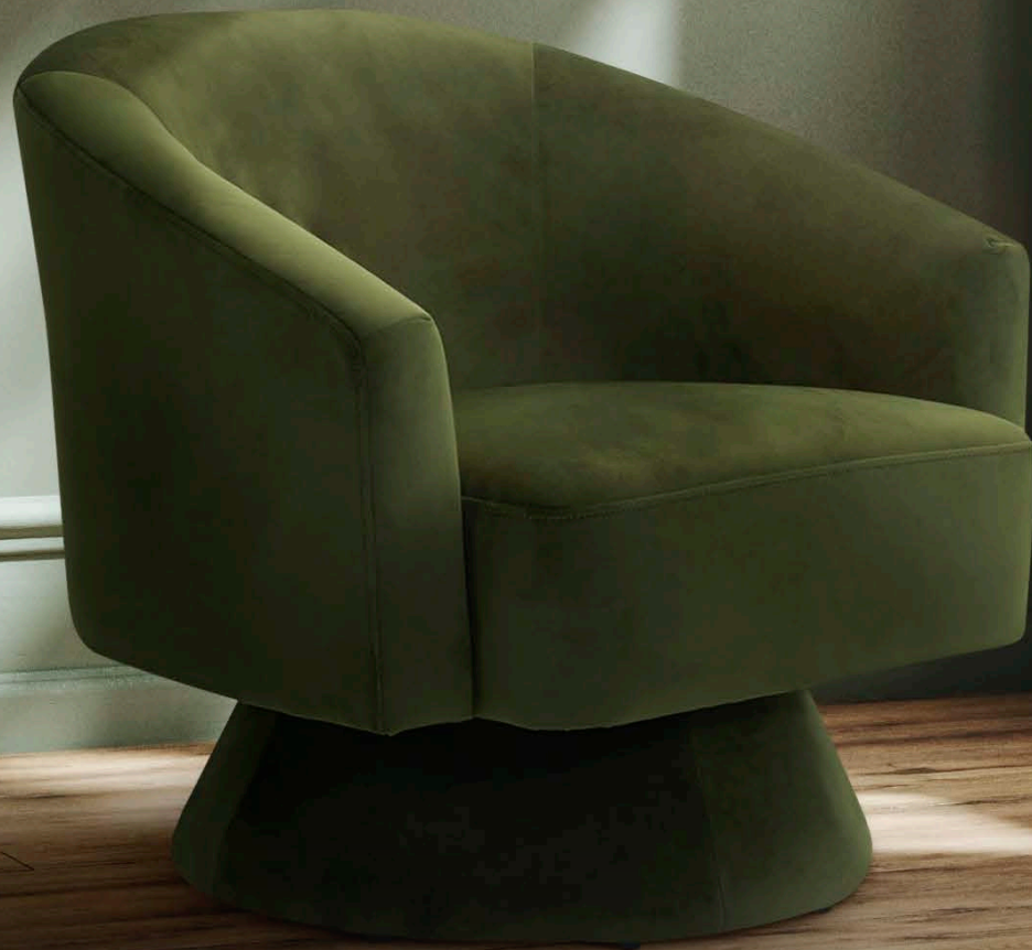
Elanor Swivel Armchair featuring Bali Fabric in 'Green'